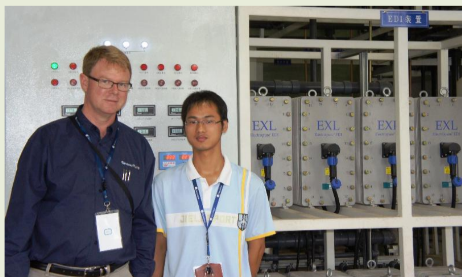
EXL System--48 m3/h

The system features 8 EXL-600 modules operating at 6 m3/h each, and has continually been producing 17.4 Megohm after 4 months of operation.